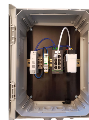
Fig. 6. INSIDE Connect in electrical cabinet with switch.

INSIDE Connect is approved for outdoor installation with the Electrical cabinet accessory.