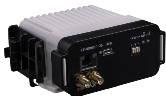
Fig. 1. INSIDE Connect router.

The router has a DIN rail adapter. The router has, among others, support for DHCP server, NAT (Network Address Translation), NAT-T and Port Forwarding. When connected to a local network, local IT security is taken into consideration and safeguarded. Connection to a local network occurs outside of INSIDE Connect and comes under the local IT-department's responsibility.