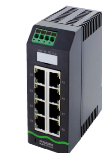
Fig. 2. Switch (accessory).

The external antennas are IP65/67-classified and can be installed both indoors and outdoors. If there is a need to connect additional products to the router, INSIDE Connect can be supplemented with a switch (max 7 devices in total). The switch is equipped with a DIN rail adapter. The Electrical cabinet accessory can be chosen when INSIDE Connect needs to be mounted outdoors or in other harsh environments.