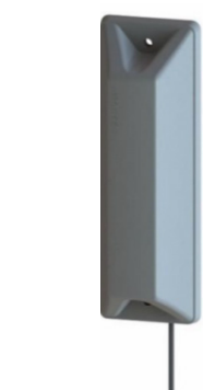
Fig. 4. External antennas (accessories).