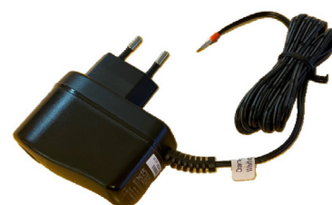
Fig. 3. Power supply unit (accessory).